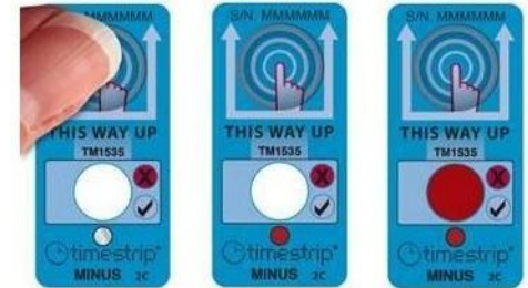
Time-Temperature indicator as a smart package