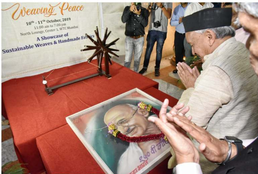
Governor pays homage to Mahatma Gandhi at Khadi Fashion Show 'Weaving Peace' in Mumbai on Friday (11 Oct) organized by World Trade Centre, Mumbai and the IAMKHADI Foundation to commemorate the 150th Birth Anniversary of Mahatma Gandhi.

MUMBAI, 11th OCTOBER, 2019, (GPN): Observing that ordinary people adopt the fashion and style of their role models, the Governor of Maharashtra Bhagat Singh Koshiyari today called upon popular society leaders to adopt and promote Khadi. Recalling that Mahatma Gandhi gave importance to handicraft and khadi, the Governor said using Khadi by masses will empower and enrich rural artisans and weavers.