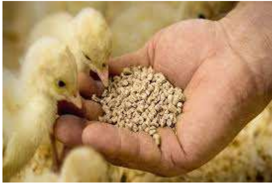
Animal Feed / PET Food