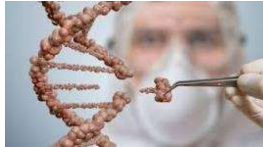
Voluntary Product Standards