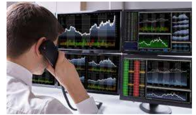
Food Equipment Manufacturer