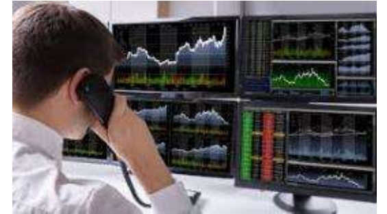
Agents, Brokers, Traders