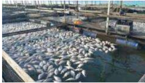
Seafood : Farms / Seacaught